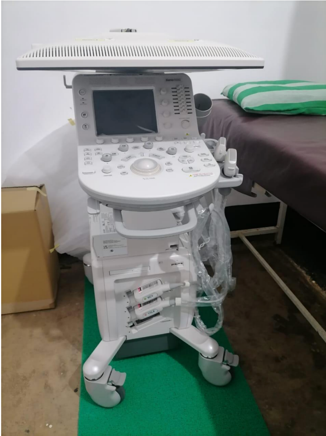
Ultrasound and Echocardiography machine